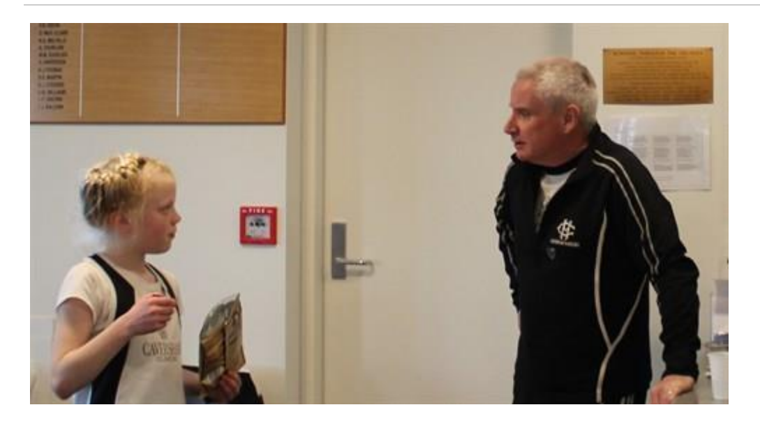
" \it Emily Rose ... are you telling me you haven't had enough?"