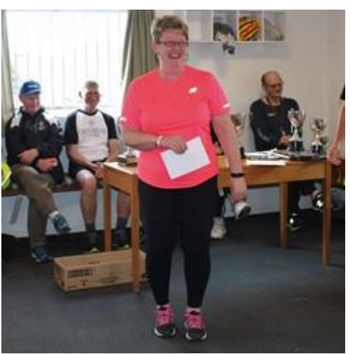
" which got Neville all excited !!! "