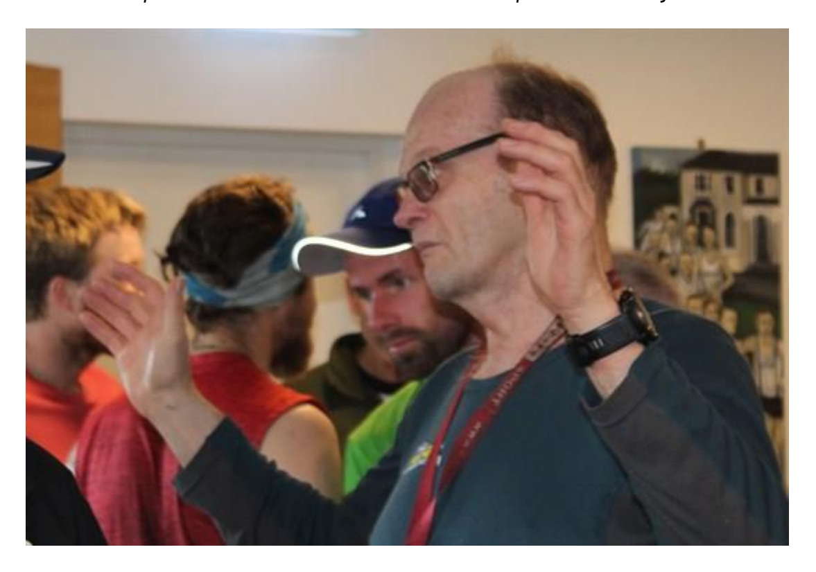
" I know nothing!, I am not a teapot short or stout, don't have a handle or spout "