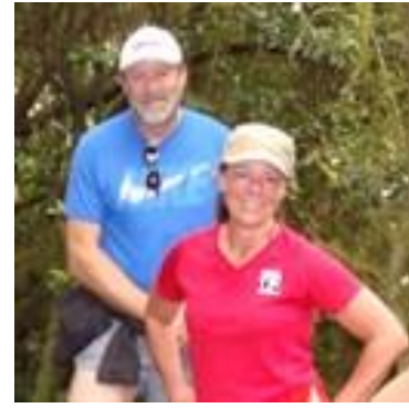
Millennium Track 2016