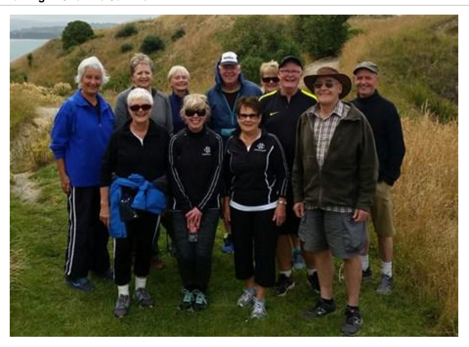
The walking group of 11 keen participants walked the Huriawa Peninsula Walk at Karitane for the first 2017 summer walk.